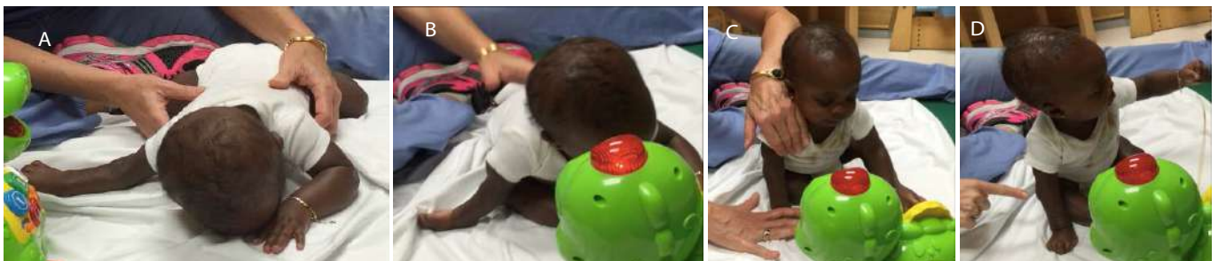
Figure 9a: Unsuccessful propping on right hand, 7 months old. b: Emerging propping on right hand at side, 7 months old. c: Hand Supporting-Hand Pulling combined technique. d: Successful independent propped side sit at 7 months old.