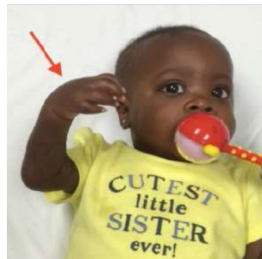
Figure 19: Hand drop, 8 months old.

challenging pattern to modulate or “re-route”, the emerging changes observed shortly prior to discontinuation of therapy suggested that the MNRI modality for Hand Grasp (Figure 13) had successfully activated the process of bringing the reflex pattern back to its genetically “given place” in the nervous system. These positive developmental changes included the new “discovery” of her own right hand (Figure 14), staring at the hand (Figure 15), bringing her right hand to her mouth (Figure 16), holding both hands at midline (Figures 16 and 17) and finally the ability to hold a toy with both hands together at midline (Figure 18).