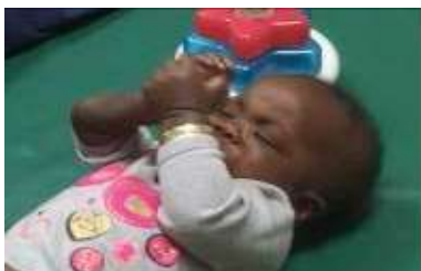
Figure 17: Bringing both hands at midline, 9 months old.