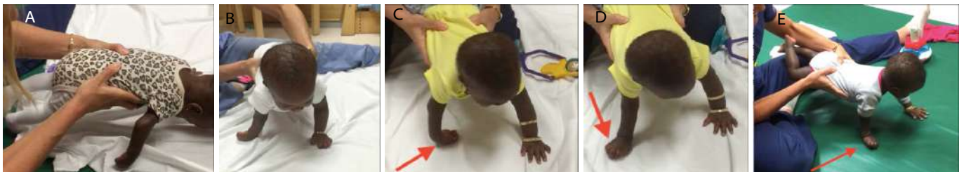
Figure 8: a: Parachute at 5 months old: inefficient, only minimal and significantly delayed right shoulder flexion triggered with poor head righting in sagittal plane. b: Parachute at 7 months old, improved head elevation, proximal control but persistent lack of elbow shock absorption and poor wrist/hand placement. c: Parachute at 8 months old with functional shoulder and elbow control, poor hand placement. d: Parachute at 8 months old, first time with active wrist extension and functional hand placement. e: Parachute at 9 months old, active wrist extension and functional hand placement thirty percent of the trials.