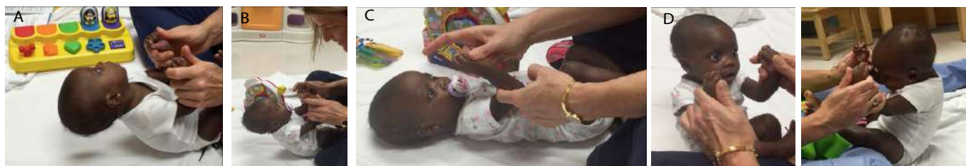
Figure 5: a: Hands Pulling at 10 weeks of age, delayed head righting, poor core flexion→visual convergence. b: Hands pulling at 12 weeks of age with improved head righting and core flexion-eye convergence. c: Showing Hands Pulling repatterning technique. d: Core flexion→visual convergence/divergence activated with Hands Pulling repatterning. e: Improved Hands Pulling with activation of right elbow flexion and core flexion in 2 sessions.

One other major purpose of Hands Supporting is protection, ability to break a fall and shock absorption in elbows. The infant’s progress with the Parachute response in this study was very significant as well.