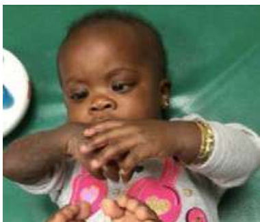
Figure 15: Staring at her own hands for the first time at 9 months.