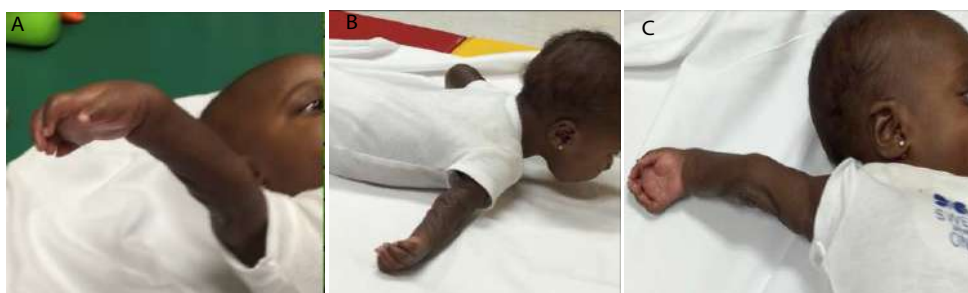
Figure 2: (a-c) Abnormal right upper limb posture into shoulder flexion-abduction, elbow hyperextension and wrist flexion with ulnar deviation, digits in flexion.

Based on the brief description of the Hands Pulling Reflex pattern earlier, it is easy to understand how this sensory-motor reflex circuit is supporting the biomechanics of the upper extremities and in particular how this pattern includes the elbow flexion part of it. Because of the existing genetic encoded links between "elbow flexion→head