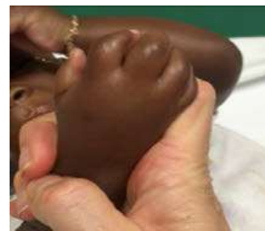
Figure 13: Robinson Grasp sensory stimulation.