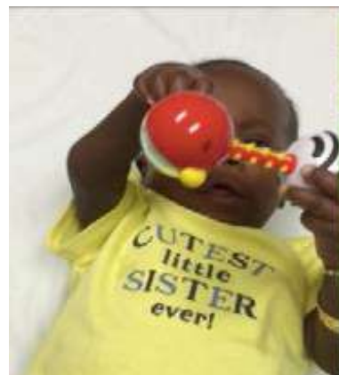
Figure 18: Bringing both hands to a toy at midline at 8 months old.

Although the Robinson Grasp Reflex pattern remained the most