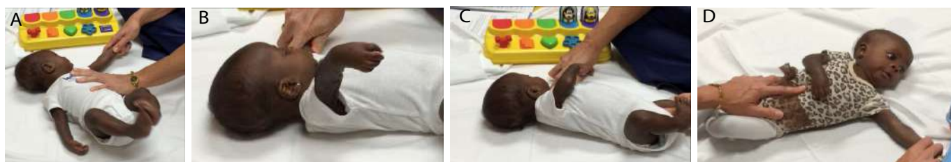
Figure 3: a Infant (10 weeks old) placed into ATNR posture, head rotated to left, left arm in ninety degrees of flexion and abduction, elbow in extension, therapist about to apply a gentle stretch at L wrist. b: Therapist performing left ATNR repatterning technique and right arm starting reacting and responding to the stimulation. c: Therapist performing left ATNR repatterning technique followed by the right elbow actively flexing across chest. d: Left ATNR repatterning strengthening the coordination between the sensory and motor neurons as repeating the technique. Right elbow flexion becoming consistent.